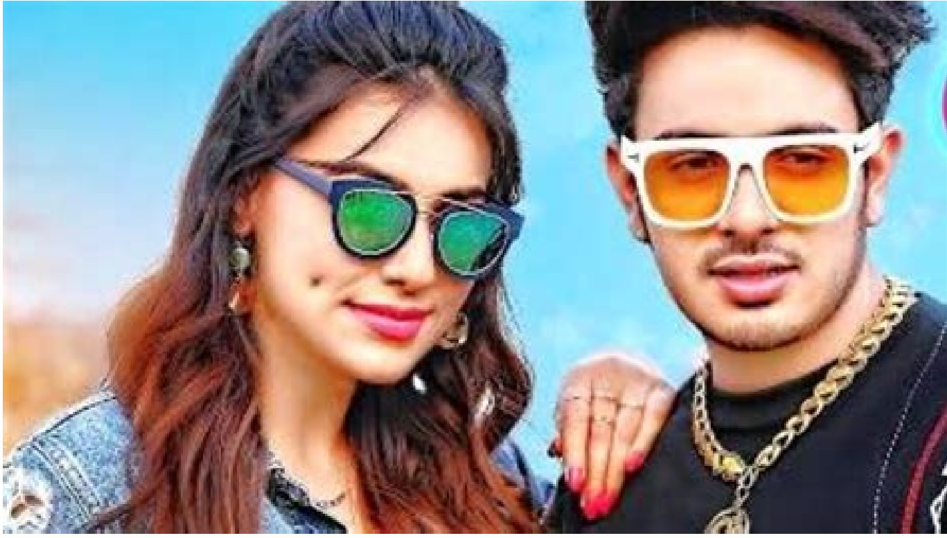
La la la song download - pagalworld mp3 bazaar.